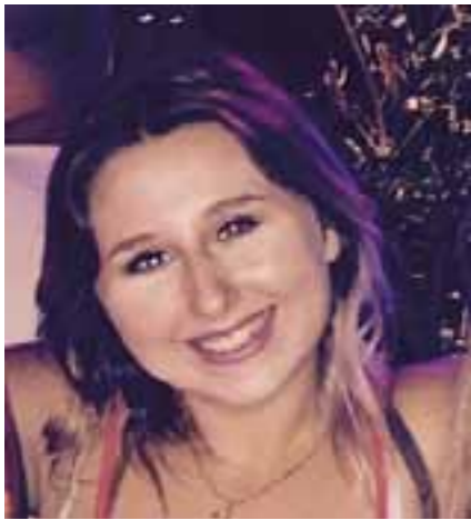
Mariah The President

Who are the People behind the New Council?